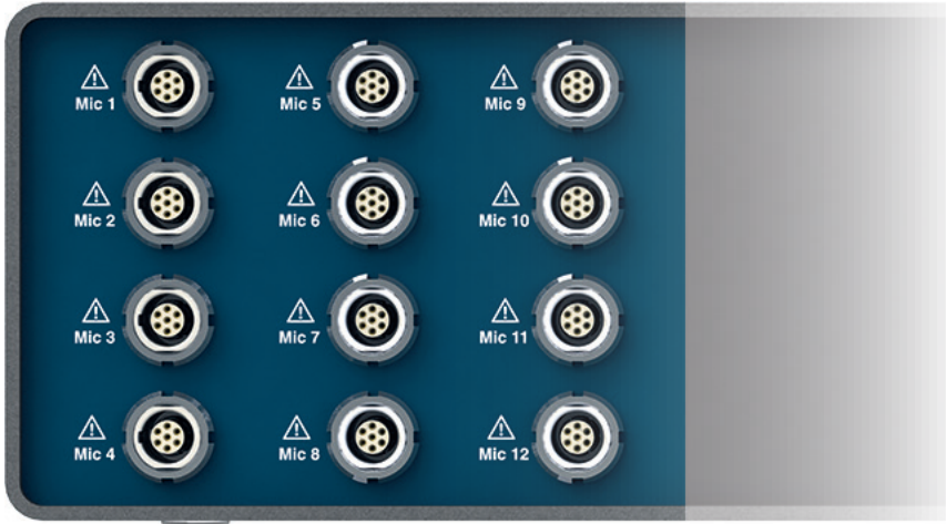
Rear panel of labCORE with three installed coreIN-Mic4 boards

labCORE supports up to four coreIN-Mic4 boards (1 x front, 3 x back).