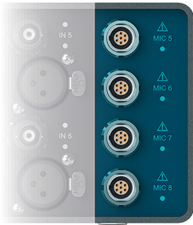
Front panel of labCORE with coreIN-Mic4